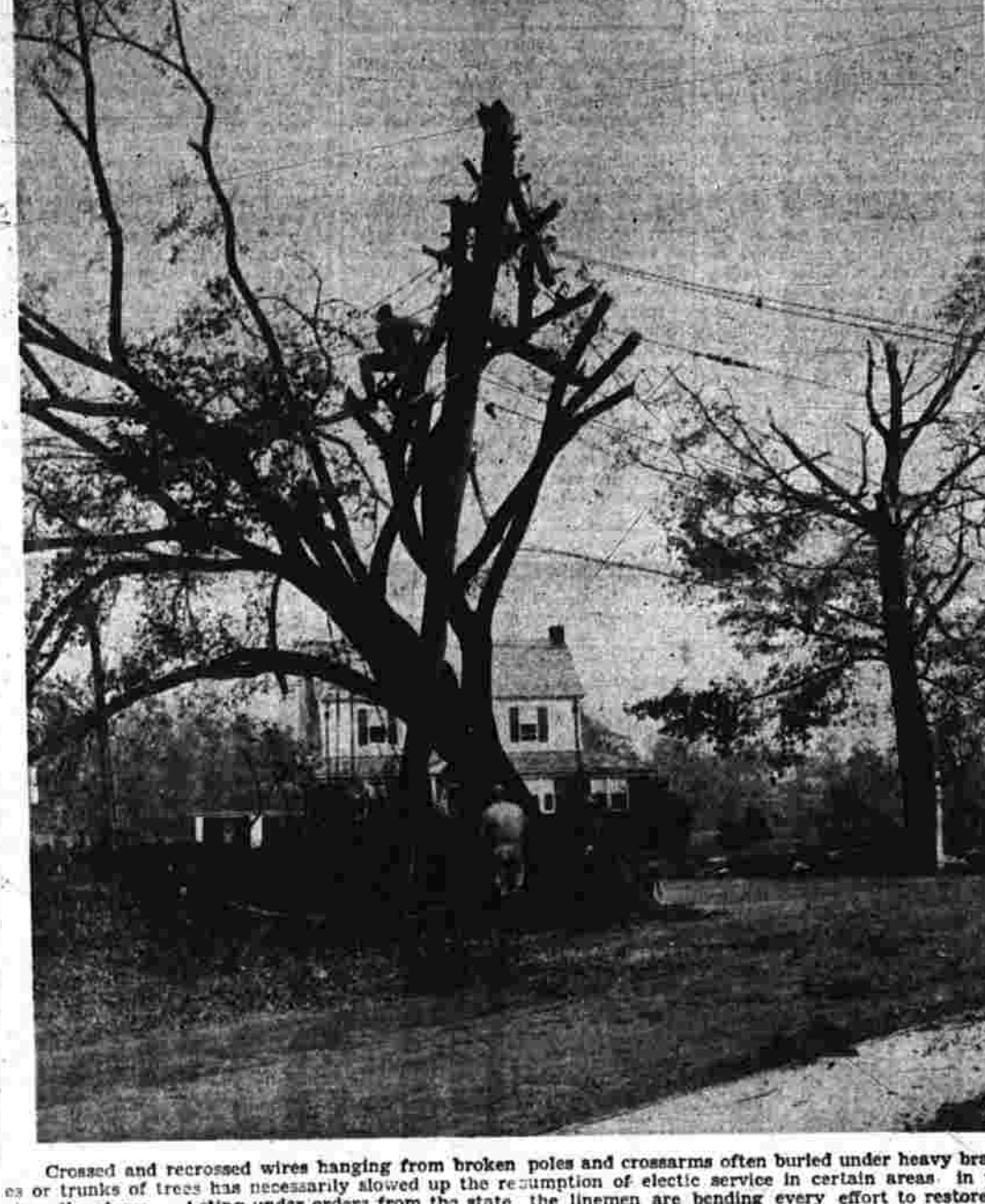
Crossed and recrossed wires hanging from broken poles and crossarms often buried under heavy branches.

At 6:00 a.m. on Oct. 1.—(AP)—A special-appointed principal took charge today of the "Vaux junior high school where 300 pupils have refused to attend classes because, their parents charged, they were robbed and beaten by a group of older boys essaying the role of big-time gangsters.